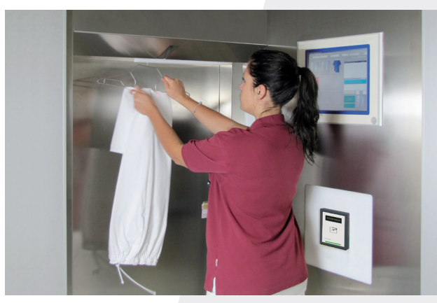
XS.Reader at the clothing machine

The built-in transponder is connected to the control module XS-O2.Nxxx / ID-Wxxxx via an RS232 or RS485 interface.