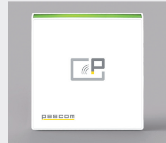
Color variant white Item No. XS-O2.R00001K100

In combination with the XS.net/io control module, the pascom XS.Reader enables secure access control to the premises.